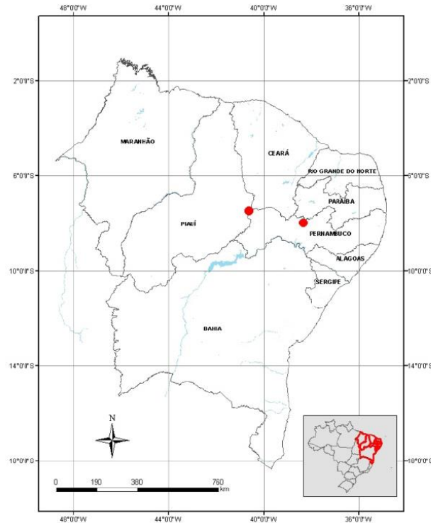
Figure 1: Study area