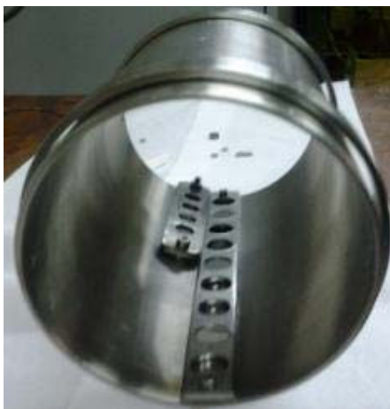
Fig. 1. Metallic SS304 tube inside which a plasma is formed for nitrogen PIII or DLC PIII&D deposition.