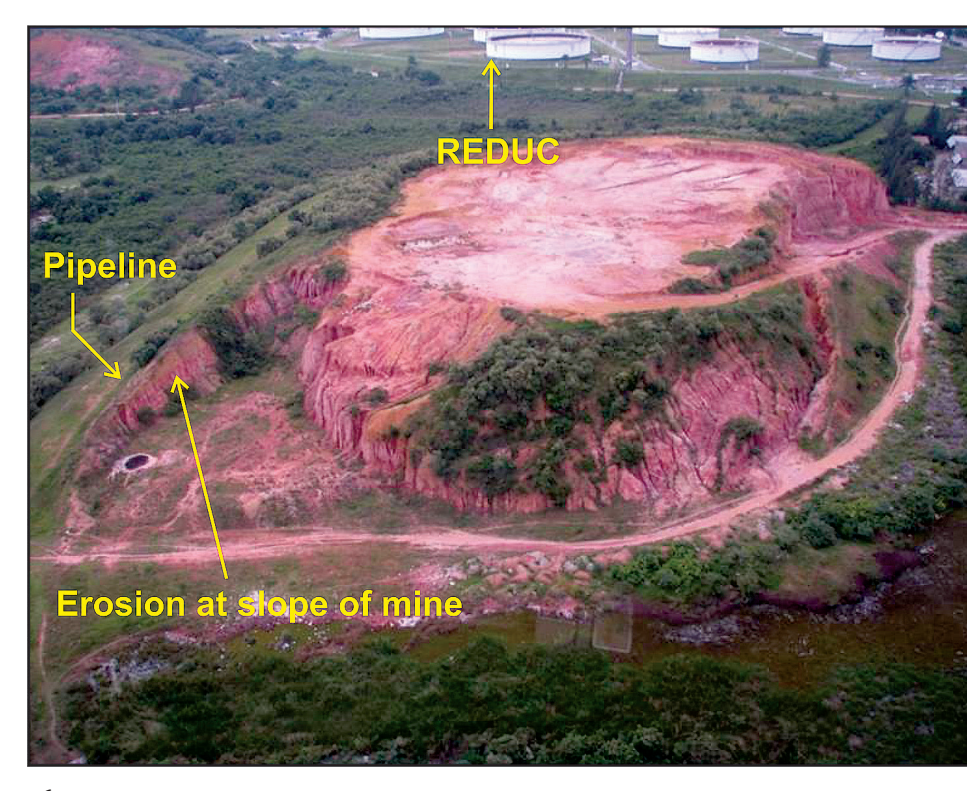
Figure 4 Grit extraction in the Duque de Caxias County (Rio de Janeiro State), close to the gas pipeline track Japeri-REDUC. The mining works extended to the boundary of pipeline track.

Sand dredging from submersed pits on the floodplain of the Iguaçu River, Curitiba County (Paraná State), that isolate the gas pipeline track Bolívia-Brasil (GASBOL).