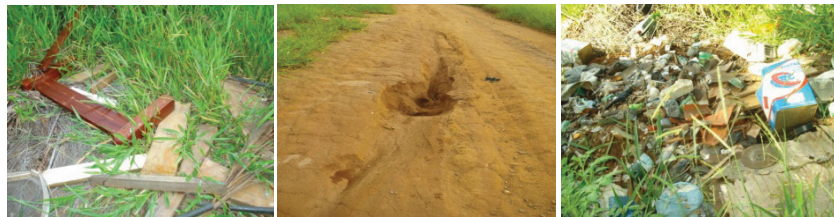
Figure 2: Waste disposed in the forest edge of the Quilombo (Yamaguchi, C.S. e Reis, M.S.).

The area is highly impacted by anthropogenic factors, showing several degradation factors such as disposal of waste from tree trimming to plastics, construction materials, wood, paint cans and other aspects of soil degradation, such as erosion, seen in Figure 2.