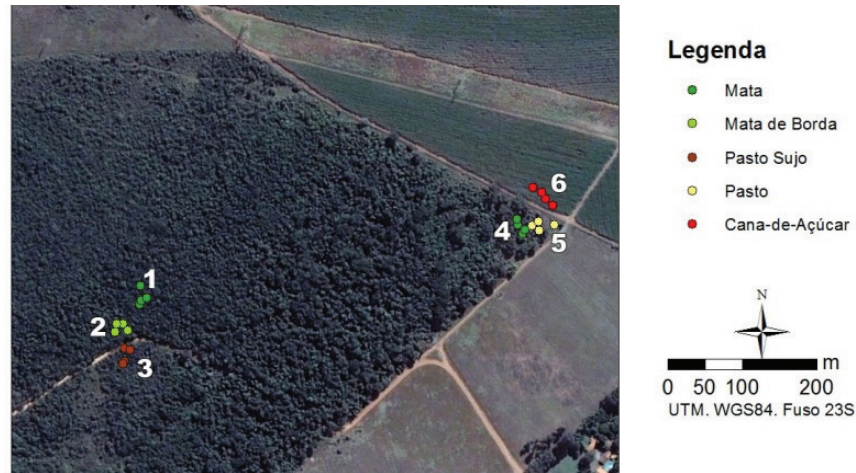
Figure 1: Points where the collections of soil were made [7]. No real value mapping. Edit: the author (Reis, M.S.).

Samples of dried soil air were subjected to chemical and grain size analysis, determining the pH ( \text{CaCl}_2 ), the content of organic matter by oxidation with \text{H}_2\text{SO}_4 and by colorimetric quantification; available phosphorus (P) and the potassium (K), calcium (Ca) and magnesium (Mg), extracted by ion-exchange resin, and quantified by colorimetry P and K, Ca and Mg were determined by atomic absorption spectrophotometry, and the content of aluminum (Al) extracted by 1N KCl and determined by acid-base titration and the values for T = cation exchange capacity and base saturation = V, were obtained by detailed calculation of the analytical methods discussed in [5].