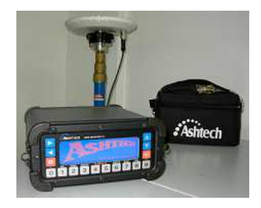
Figure 3 – Ashtech Z12 dual frequency GPS receiver

The GPS receiver used is the Ashtech model Z12 (Ashtech, 1999), which provides 12 channels for GPS satellites tracking, and provides measurements in two-frequencies (L1 and L2), see Figure 3. It makes full use of the GPS constellation and yields navigation accuracy with aeronautical quality, although such accuracy is not needed herein. The data were stored internally in its mass memory and retrieved further through a RS-232 serial port. Actually, it may provide real time PVT (Position, Velocity, Time) navigation solution at 1-2Hz at most, besides the GPS time (accurate to 10micro-seconds) and DOP (Dilution Of Precision) quality flag which indicates the geometrical strength of the solution. The PVTs were obtained in this work at 1Hz rate, allowing to compute the theoretical geomagnetic field at that position, which is an important information to the calibration and to the attitude determination system.