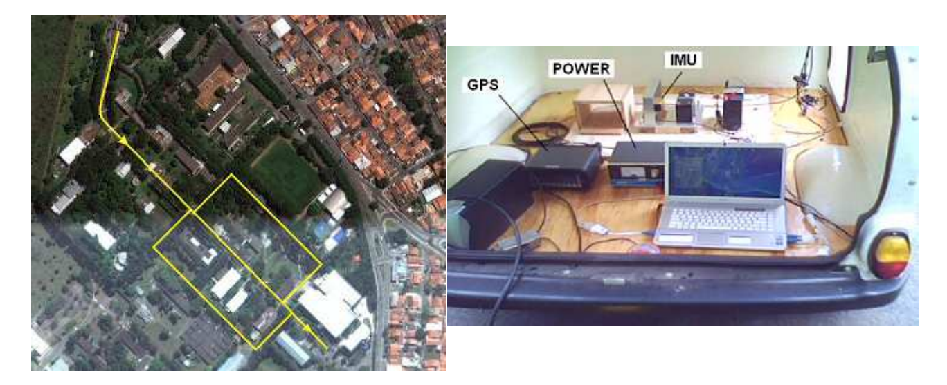
Figure 4 – Trajectory of the experiment and assembly

The experimental assembly is shown in the right picture of Figure 4, where one sees the laboratory trailer (nonmagnetic fiber structure) with the GPS unity, IMU, power supply, and a notebook for data recording. The magnetometer unity is hidden because it is fixed on top of the roof outside the trailer. The axes of the IMU and magnetometer are aligned horizontally and with the longitudinal axis of the trailer motion. The trailer was towed by a car along a path of 542m depicted in the left of Figure 4, from (45.86138141W, 23.20844975S, 609.222m) to (45.85760508W, 23.21187649S, 613.866m), recording all the data from the IMU, GPS, and magnetometer units. The path was made in a very slow movement so as not to excite longitudinal accelerations on the accelerometer. Because the calibration is, in principle, an off-line procedure, the different batches of different sensors were all correlated in time (GMT), so as to guarantee a synchronization when all the data are assembled and merged. Unreliable GPS navigation solution with PDOP (Position Dilution Of Precision) \geq 5 were disregarded and not used to tag the position.