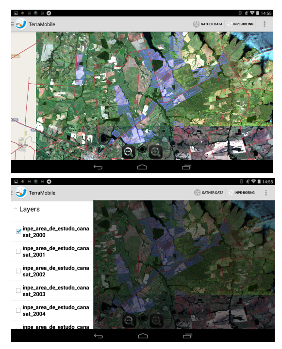
Figure 2 - TerraMobile App.

Our thanks to Boeing Research and Technology – Brazil (BR&TB) that is funding the development of the TerraMobile App under the INPE-Boeing project "Geotechnologies for Efficient Energy Crop Management".